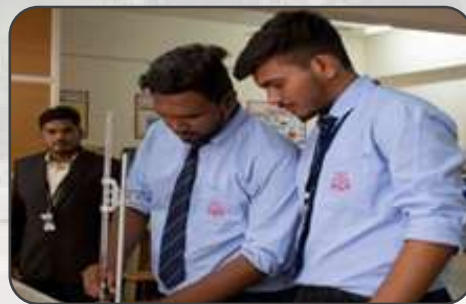
Engineering Chemistry Laboratory