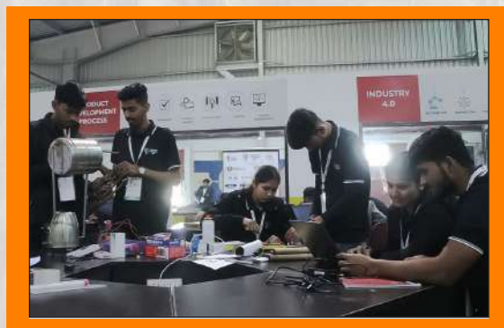
Students Selection in Smart india Hackathan