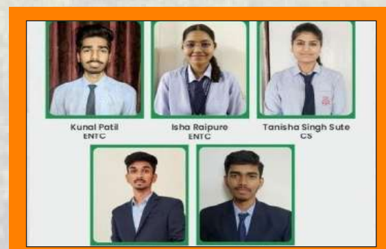
Students Selection in Smart india Hackathan