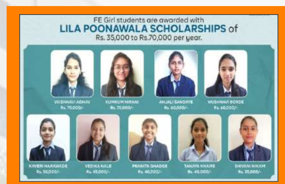
Selected For Lila Poonawala Scholarship