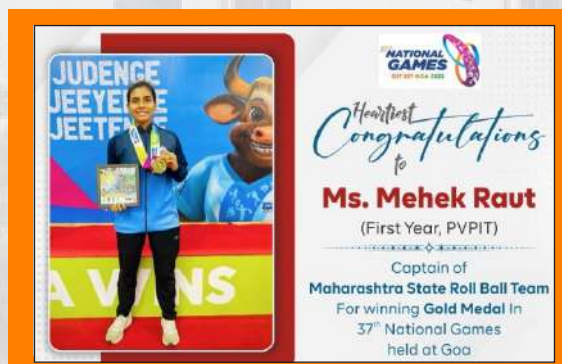
Select as Captain in Maharashtra Roll Ball Team