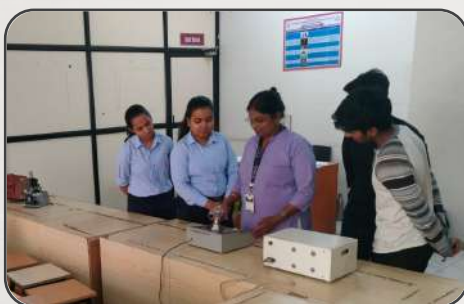
Engineering Physics Laboratory