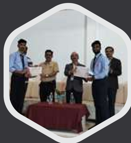
Prize Distrubution to poster making winner