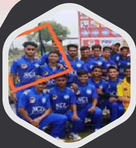
2 FE Students Selection in National Cricket Team